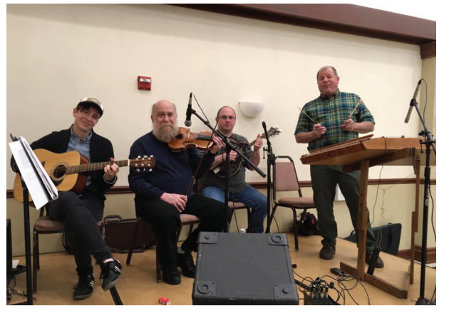
Fri 8:00 pm @ Pavilion

The Brickersons (formerly Boys of the Hock)